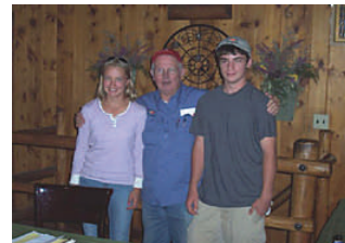
2008 GAS SUPERFLY TEAM